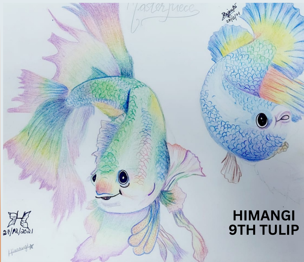
HIMANGI 9TH TULIP